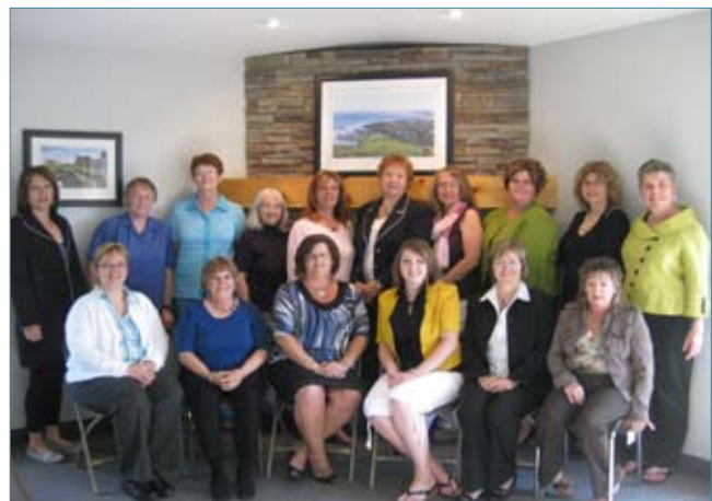
HURON WOMEN'S SHELTER STAFF 2009

Huron Women's Shelter is blessed to have many long time staff and experiences a very low staff turnover rate – a tribute to the organization and it's hard working, dedicated and compassionate staff.