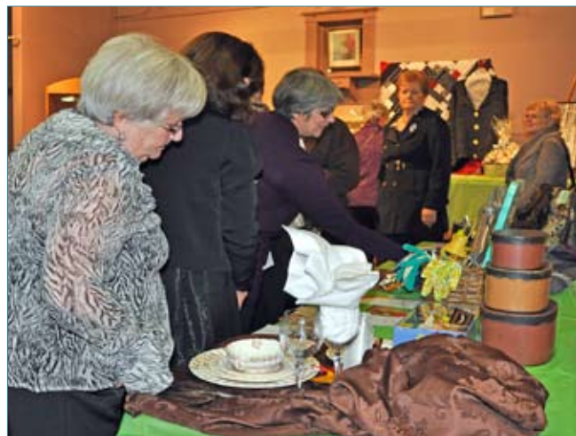
THE CLOCK MAKER: Theatre-goers peruse the variety of items up for bid in the Silent Auction.

HWS hosted their Gala event at the Blyth Festival Theatre on October 14th, 2011. Talented actors performed for a packed house, bringing in a grand total of $11,126 for HWS, which included ticket sales, as well as silent auction and raffle proceeds. A very special thanks to all who supported this special event.